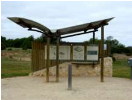
Good information available.

The 42 Mile Crossing is an excellent camping spot, well protected from the wind and with plenty of good flat sites. A few of these are shady but be prepared to be in full sun. A picnic shelter and toilets are centrally located within the camp ground. The 42 Mile Crossing is the largest of the camp grounds in the Coorong National Park. It is suited to all types of recreational vehicles, including buses. There is plenty of room for children to run around and explore or kick a football. There are large open areas suited to groups of campers and a few secluded spots for individuals. The picnic shelter is suited to large groups.