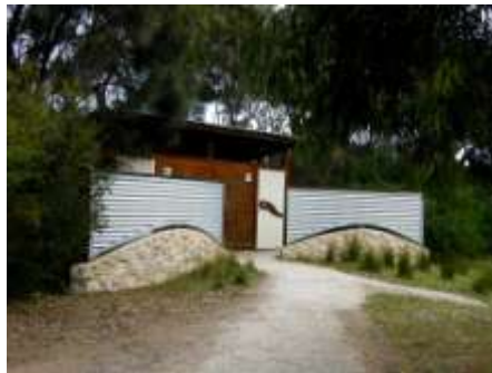
We love these toilets!