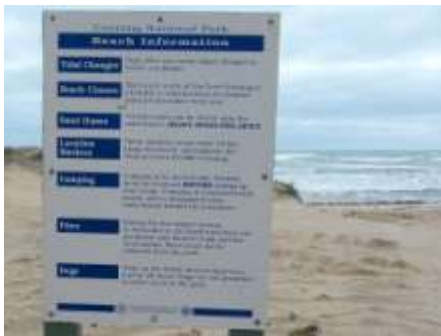
Check 4WD and fishing restrictions

The 42 Mile Crossing is the only camp ground providing year round walking and 4WD access to the ocean beach. The Nukan Kungun Hike passes through the camp ground and you can take this walk to the ocean beach or hike north to Chinaman Well and on to Salt Creek. If you are planning some ocean beach fishing the 42 Mile Crossing camp ground provides a protected spot to return at the end of the day.