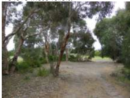
A few small shady sites