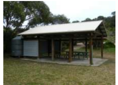
Large sheltered picnic area