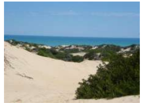
Prepare for soft sand along the 4WD track