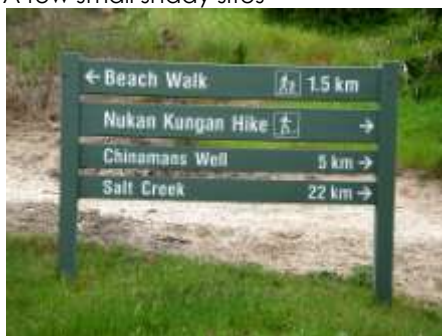
Access walking trails adjacent to the picnic shelter