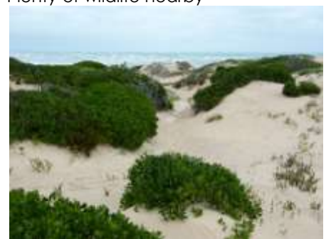
The end of the Nukan Kungan Hike – arriving at the ocean beach