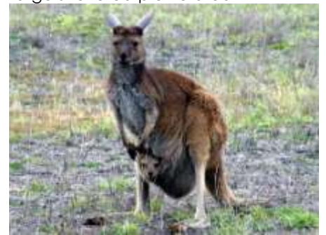
Plenty of wildlife nearby