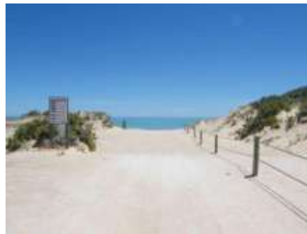
Ocean beach end of the 4WD track