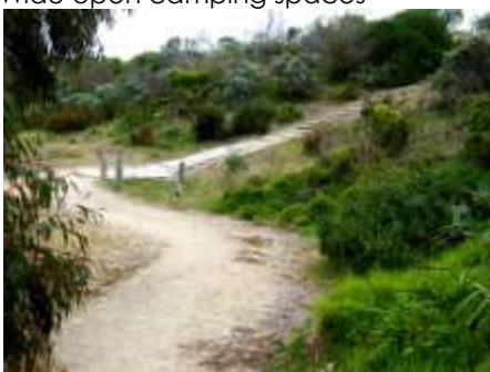
Good walking trails