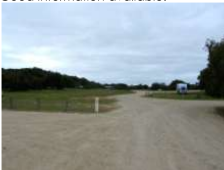
Wide open camping spaces