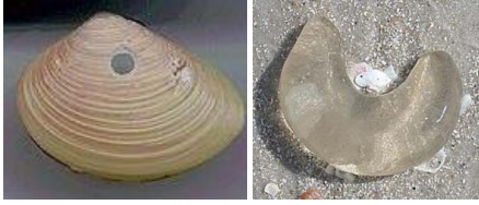
Cockles + Sausage Jellies